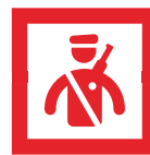
CHANGING APPROACHES OF LOCAL AND NATIONAL AUTHORITIES

Members must be agile and adapt to changing approaches of local and national authorities towards the work of NGOs, and COVID-19 restrictions, among others. Security concerns vary across the country and can change quickly. This contributes to many DEC members adopting a low-profile in their areas of intervention and particularly when travelling. Members report that they have not experienced any direct attacks on organisational assets or staff, however, staff often frequent public locations that are vulnerable to attack. The general fear of attack in these places may limit NGO access to community members.