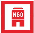
MISUNDERSTANDINGS IN PRIORITISATION OF HUMANITARIAN ASSISTANCE

Extreme poverty is prevalent across much of the country, particularly in target communities. Despite the effectiveness of aid to those who received it, the need on the ground is much greater and constantly growing. In some instances, the number of eligible individuals in the community is much greater than the available resources. In some areas, participants were divided in small groups to avoid attracting any attention on distribution sites, reducing protection concerns. This was done in consultation with community leaders to avoid contributing to potential community conflict. Programme staff must also make time to regularly debrief on safety, timeliness, and accessibility of distribution, and how these factors might contribute to protection risks.